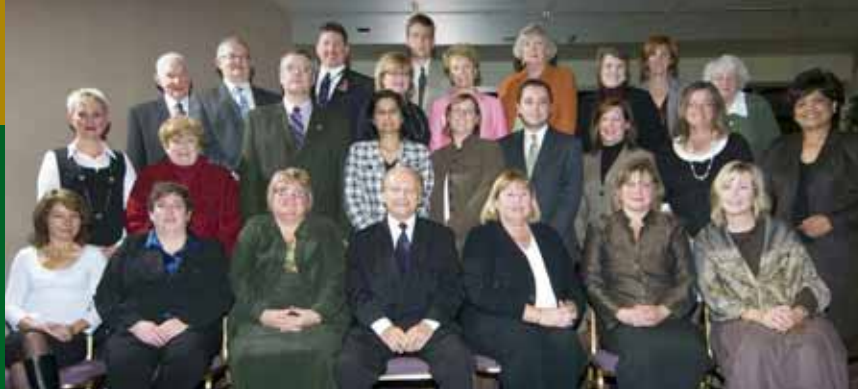
Above: Representatives from the Grant Recipient Organizations at the 2008 OPAL.